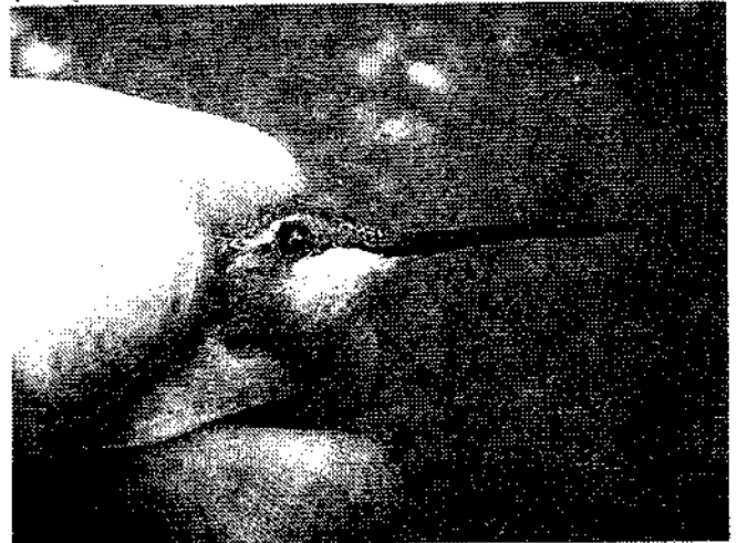
Fig. 1. All Ruby-throated Hummingbirds captured and banded at Hilton Pond Center for Piedmont Natural History, York, SC, also receive a bright green color mark on the upper breast. The mark is especially visible on females (below) and similar-looking young males, but the metallic gorget and gray flanks on an adult

Color-marking RTHU at Hilton Pond has the added benefit of making my banded hummingbirds more noticeable to observers away from the banding site. In fact, it was primarily because of green dye that observers reported RTHU from Hilton Pond at four distant locations described below.