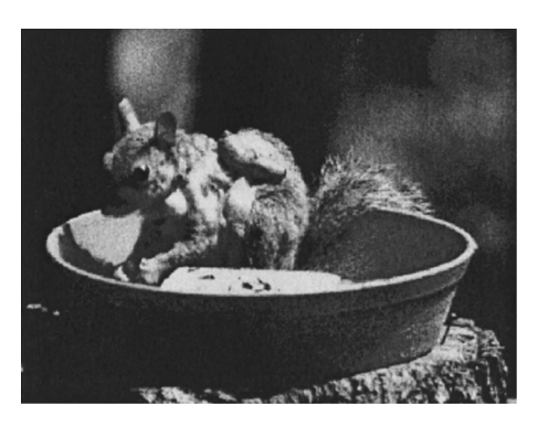
Fig. 3. Eastern gray squirrel (at a seed feeder) heavily infested with larvae of C. emasculator .

J. Agric. Urban Entomol. Vol. 20, No. 2 (2003)