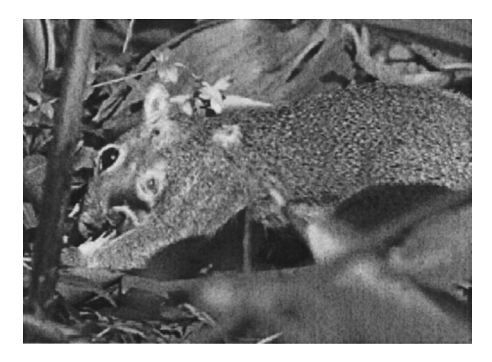
Fig. 1. Eastern gray squirrel foraging at Hilton Pond Center (York County, South Carolina) with midsized Cuterebra emasculator bot fly warbles (open lesions) in neck and shoulder regions.

hairless, especially if they can be reached and scratched by the host squirrel's hind legs (Fig. 3; Slansky & Kenyon, 2000, 2001a). This visible confirmation of larval infestation is fortuitous, as the adult flies are seldom seen in the wild (Sabrosky 1986, Slansky & Kenyon 2000). There is a viral disease (squirrel fibromatosis or pox) that also causes lesions on squirrels, but these typically differ from warbles in appearance, intensity and location on the host (Slansky & Kenyon 2001b). In addition, squirrel pox is rarely seen in South Carolina (personal communication from several wildlife rehabilitators; see acknowledgments). Thus, it is unlikely that a bot fly-infested squirrel in South Carolina would be misdiagnosed. Third, tree squirrels, especially S. carolinensis , are relatively common in urban, suburban and rural areas, and are frequently observed raiding bird feeders or drinking from bird baths. Fourth, injured, ill, and orphaned squirrels are often brought to wildlife rehabilitators or veterinarians for care. Fifth, squirrels are hunted as a small game species, allowing hunters to also examine them firsthand. Taken together, these factors make the association between C. emas -